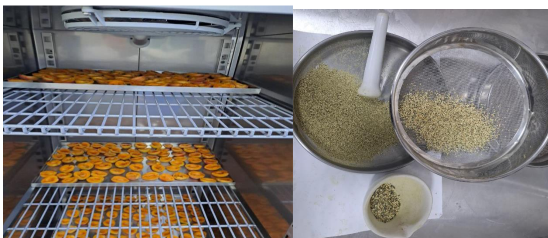
Figure 1. Samples of raw materials prepared for drying

When drying the skin of the pumpkin, organoleptic parameters (shape, size, taste, color and smell), shape and content of active vitamins were preserved;