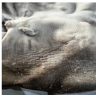
After the washing process

The system presented in Figure 2 illustrates the continuous production chain for converting African catfish skin into leather. The process begins with preparing the raw skin to adapt it to the technological environment: washing removes dirt, salt, and blood residues; during the fleshing process, the hypodermis is removed; then, liming and deliming processes are carried out to achieve fiber separation and softening, and to lower the pH. Due to the abundance of fats and lipids characteristic of fish skin, degreasing is performed to reduce the tendency for odor and oxidation. Afterwards, the skin is sent for pickling, where its porosity is increased, creating the necessary environment for chrome tanning. Tanning is typically carried out with chromium(III) salts, forming collagen-chromium complexes, which increases microbiological stability and heat resistance (see Figure 3).