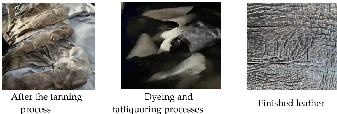
Figure 3. Photographs of the main technological processes for obtaining leather from African catfish skin

In the final stages, the semi-product is re-washed, and through processes of tanning replenishment and fatliquoring, the structure is strengthened, while dyeing and fatliquoring improve the aesthetic appearance and flexibility properties of the fish leather, while preserving its unique texture. Compared to the processing of mammalian animal skins, low temperature, a clean environment, control of time-reagent consumption, and pH control are considered crucial for all processes. As a result of processing within this system, raw fish skin can be transformed into leather with improved stability, elasticity, and aesthetic quality indicators (Figure 3).