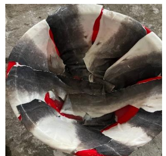
After the liming process