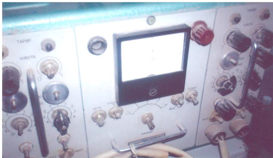
Fig.1.3. General view of the electrical measuring equipment complex for tensometry