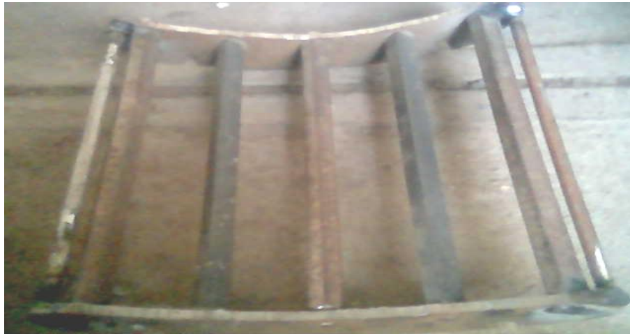
Fig.1.1. Section of a grate with multifaceted grate bars on elastic supports before installation on a cotton cleaner.