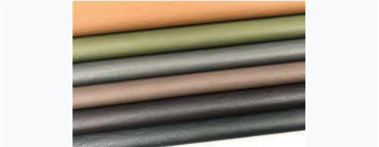
Figure 2. Faux Leather

Outerwear made of artificial leather is designed for spring and autumn seasons, in which the weather is very changeable. Recommended types of clothing made of artificial leather (suit, jacket, cloak) are very important at this time. The reason is that the recommended types of clothing are distinguished from other artificial leather products by the fact that they are breathable, do not make the body uncomfortable in hot days, and do not catch the cold in cold days. In addition, it is possible to produce different types of shoes using artificial leather raw materials. Clothes made of artificial leather are a type of clothing that meets the aesthetic requirements of today's modern day.[13,12]