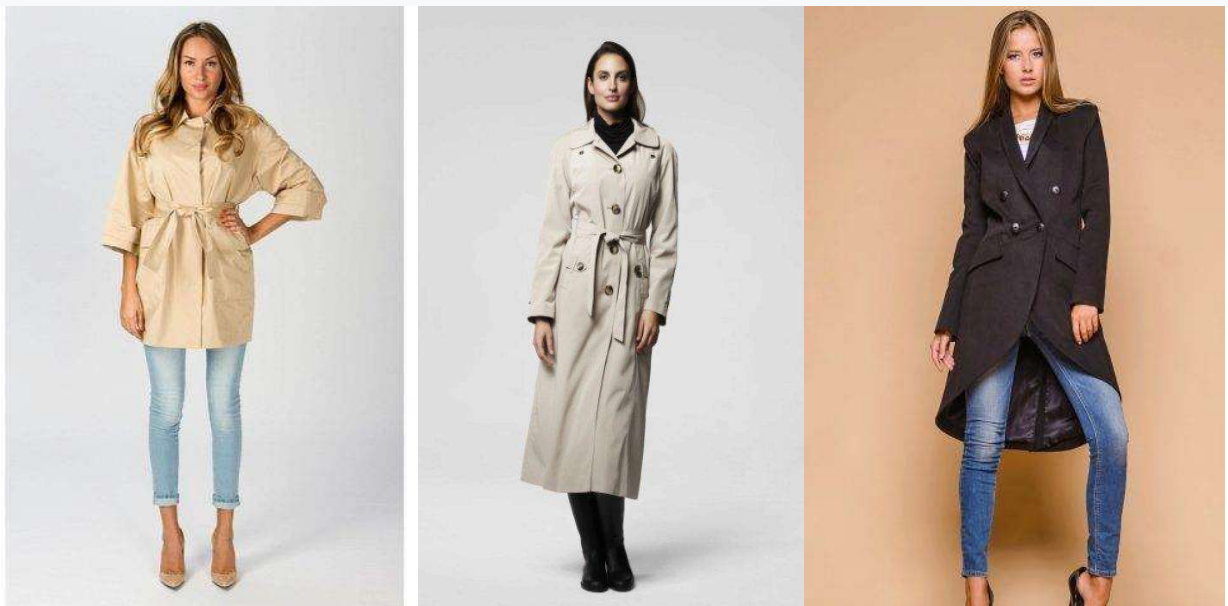
Figure 1. Cloaks of different lengths

Today, we can find women's cloaks in different lengths. For example, from the short length to the longest look. Modern women choose different types of cloaks according to their comfort and preferences. These are different lengths for tall, middle and small women, and every woman has a length that she is comfortable with. [5] (Figure 1)